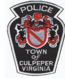
Culpeper Police Department 8 Year Internal Affairs Statistics